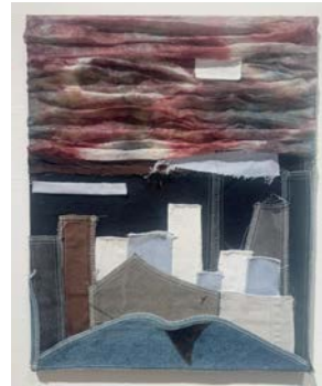
Sin City at Night , 2025 fabric collage on canvas 24 x 12 inches $222

Alfredo Quiroz (b. 1997) works across music, fashion, and performance to explore transformation and identity. The artist approaches creation as a fluid process that bridges internal and external worlds, welcoming experimentation and honoring the personal stories that shape us. Quiroz works primarily with denim and upcycled materials, transforming everyday fabrics into works that connect spirituality, culture, and sustainability. His multidisciplinary practice weaves together rhythm from music, presence from acting, and cultural memory from fashion design to create immersive, emotional experiences. Rooted in authentic self-expression and storytelling as connection, his work invites viewers to reflect on their own narratives and imagine new possibilities for themselves.