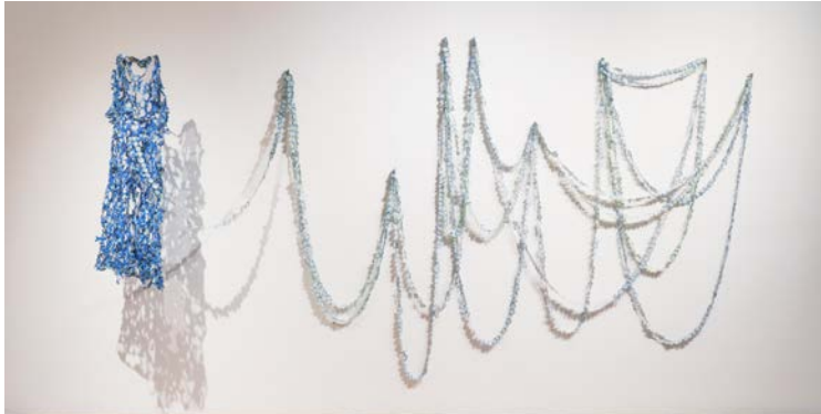
The Solace of the Spinster, 2025 vintage dress from artist's wardrobe, starch, hand cut and hand stitched