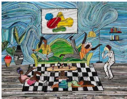
What's Understood, 2025 folded magazine adhered to canvas 16 x 24 inches $4,700

Tschaner Sefas (b. 1988), also known as Tschaner Azubuike, is a Texas based visual artist and the creator of 31:13 Ecofriendly Accessories and Fine Art. Sefas transforms upcycled paper into sculptural canvases that explore transformation, femininity, and interconnectedness. Working with folded strips of magazine paper, she creates vibrant compositions that honor the resilience and unique stories of the women who have influenced her life. Each piece reflects her own process of healing, self-discovery, and acceptance, while emphasizing environmental sustainability and the human ability to be reshaped, revitalized, and renewed. Her work celebrates renewal in all its forms, highlighting the beauty that emerges when fragments are gathered, reimagined, and brought into wholeness. Pieces such as Before the Bell Rings and What's Understood extend this vision, celebrating both the imaginative freedom of childhood and the restorative joy of women's shared spaces.