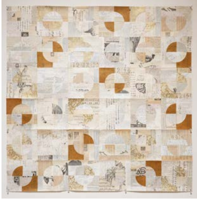
Study for a Paper Quilt , 2025

various papers glued to a non-woven synthetic substrate