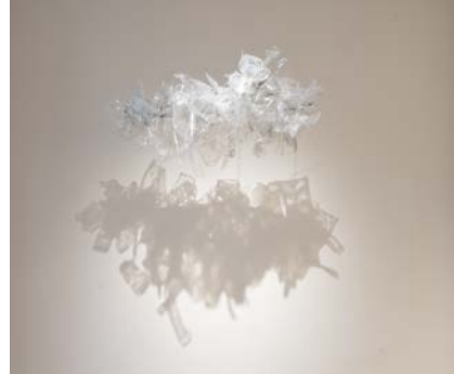
Electric Storm , 2025 scrap plastic and LED lights 36 x 18 x 18 inches $1,000

Bruce Warren Davis (b. 1947) creates objects that sit at the intersection of functional design and art. His practice begins with the most humble materials, plastic en route to the landfill, broken furniture abandoned at the curb, and other remnants discarded by consumer culture. Through careful reconstruction, he transforms these overlooked materials into works that challenge assumptions about value and purpose, asking viewers to reconsider what is salvageable, useful, and worthy of attention. His approach reflects a commitment to rescuing the unwanted and revealing the potential embedded in everyday debris.