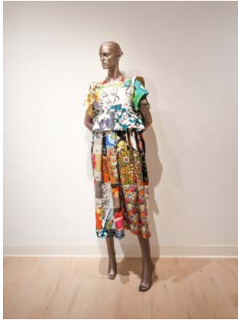
THE PATCHWORK DRESS , 2025, Woven patchwork of salvaged, discarded, and remnant fabrics in multiple fiber contents