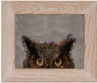
Great Horned Owl , 2025

needlepoint mosaic stitch, hand stitched, repurposed window screen, previously owned cotton embroidery floss, repurposed wood frame