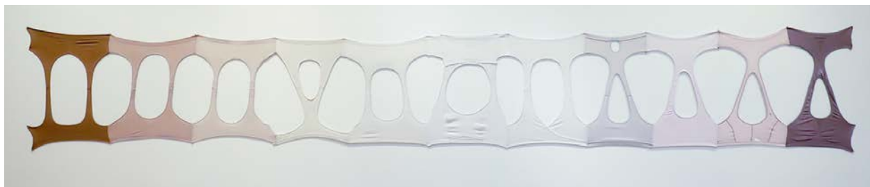
Untitled , 2015, used sports bras, thread, 144 x 24 inches, NFS