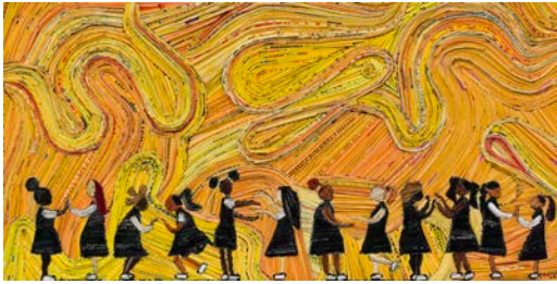
Before the bell rings, 2024 folded magazine adhered to canvas 15 x 28 inches $6,000