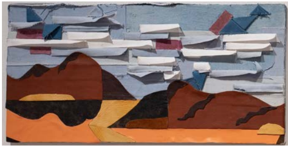
Desert Hills , 2025 fabric collage on canvas 24 x 12 inches $333