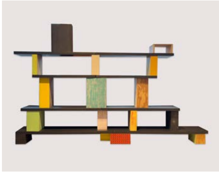
Set of Blocks , 2025 salvaged wood and acrylic paint 80 x 60 x 12 inches $3,000