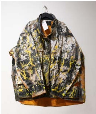
THE UP-CYCLED FIREFIGHTER'S JACKET , 2025, Out of Circulation Up-cycled Firefighter's Jacket and Polychrome Acrylic Paint