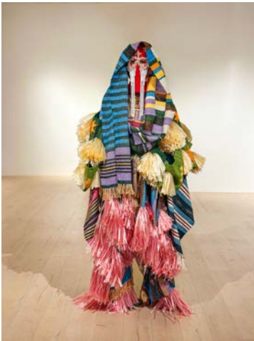
La Puta , 2025

Churro wool and Viscose Raffia, variable dimension