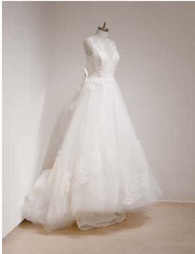
Lazaro Perez wedding gown, 2013