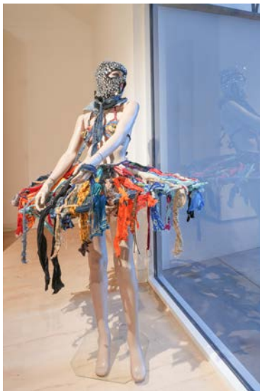
The Ballerina Fit, 2024

studded full face mask, cone bra made of vintage scarves, denim bikini bottom and a full tutu made of vintage scarves (4 pieces)